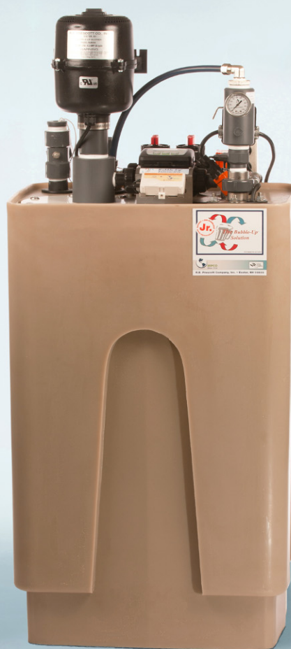
Bubble-Up Jr. Interactive