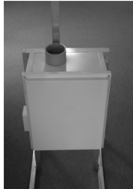
GBR76 WITH ROOF MOUNT